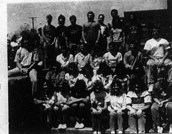
CLASS OF 1988 PEOP CLUB