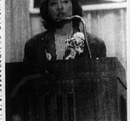
The First Lady of Kentucky spoke to many academically successful Nicholas County High School students during an awards program presented at the high school.