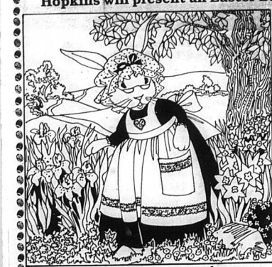
Picture for 9-10 yrs. to color