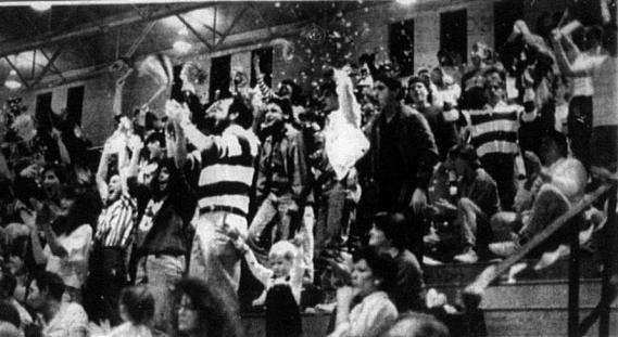
Nicholas County fans jump to their feet during the final game of the 97th District tournament Saturday, Nicholas fell to Bourbon County, yet still go on to the 100th Region tournament.