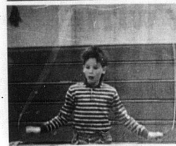
A Nicholas student jumps rope during his physical education class for "Jump Rope For Heart."