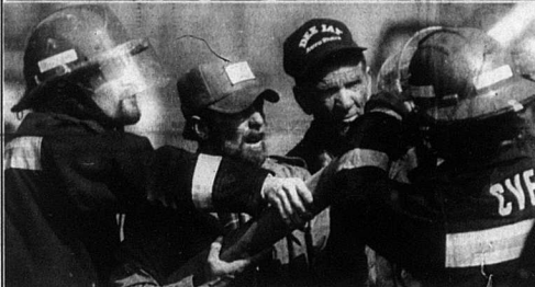
A five alarm fire swept through this Broadway Street residence, Monday afternoon. Departments from Carlisle, Millersburg, Paris and Bourbon County, along with the Nicholas County Department battled the blaze for several hours. There were no injuries from the fire, however the structure was a total loss.