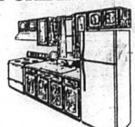
Model kitchen on display.

NATURAL OAK CABINETS Immediately Available From Our Carlisle Warehouse FREE ESTIMATES!