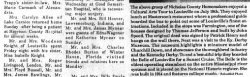
The above group of Nicholas County Homemakers enjoyed a Cultural Arts Tour to Louisville on July 18th. They enjoyed lunch at Madison's restaurant where a professional guide boarded the bus to point out some of Louisville's finest attractions.