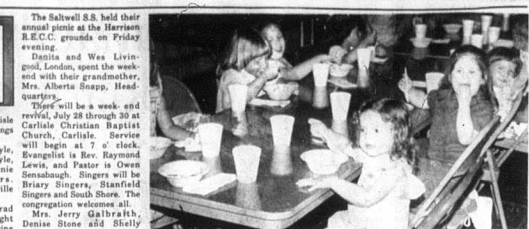
The Saltwell S.S. held their annual picnic at the Harrison R.E.C.C. grounds on Friday evening.