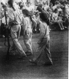
Blackberry Festival Celebrations