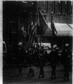
Nicholas County residents took in what the Independence holiday is all about as they paid homage to the stars and stripes.

With assistance from "Grandpa," this little tyke became fascinated by the blink of the lights and continuous center of the Carousel horses at the annual Blackberry Festival.