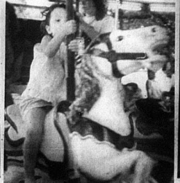
Who says those under 12 can't drive? This little one appears perfectly confident aboard a festival special cycle and side.