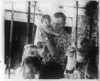
With assistance from "grandpa," this little tyke became fascinated by the blink of the lights and continuous center of the Carousel horses at the annual Blackberry Festival.