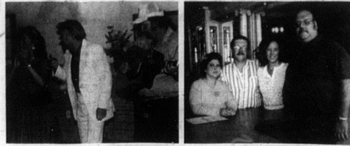
Pickin', grinin' and cookin'