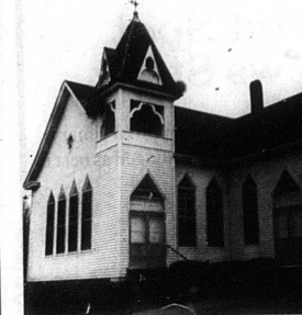
A Methodist Church has stood on this spot in Saltwall for over 100 years as the first church was dedicated in 1879. This new church was built in 1916.

At the rededication ceremony these final words were read, "As the Saltwall Church stands here in this valley may it ever remain as a light-house to those who tread these country roads that lead to the north, south, east and west of this rural community."