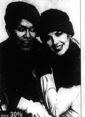
Reg. #723. Entire stock of knit accessories. Ward off the chills with knits from Aris and Fownes. Every one of our knit hats, scarves, mittens, and gloves is 30% off in solids and prints.