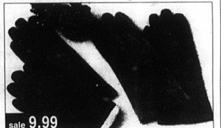
sale 9.99 Reg. #16. Lined suede gloves from Aris and Fownes. These name brand gloves are better than ever because they're specially priced for the holidays! Thinsulate or acrylic linings. S-M-L.

SILK SCARVES 11.99 & 15.99 Wrap one of these up for someone special. Society Houses pure silk scarves are as colorful as a Christmas tree, but last long past the season. 32" square or 12" x 54" oblong. Reg. #18 & 21.