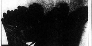
sale 17.99 Reg. #22-27. Fownes leather gloves. Treat yourself to the luxury of leather at prices you can't afford to miss. Smooth, soft, supple and fully lined in warm acrylic or angora. Textile colors including black, grey, taupe and red.