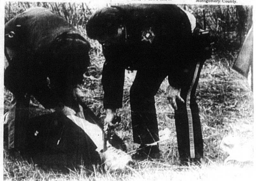
Captured at gunpoint