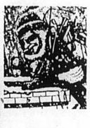
Hey kids, write Santa

In keeping with a longstanding tradition, The Carlisle Mercury will again publish letters to Santa this Christmas season.