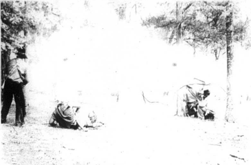
Smoke clears and the wounded are counted during a battle at the Blue Licks State Park battleground.