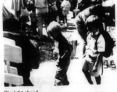
These young men move straight ahead into Nicholas County Elementary School on their way to the first day of school.