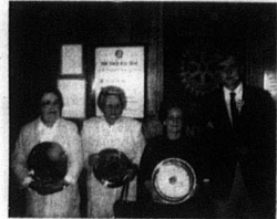
Rotary recognizes years of service