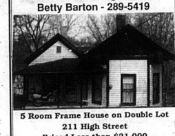
5 Room Frame House on Double Lot 211 High Street Priced Less than $21,000

FOR SALE - By Owner Betty Barton - 289-5419