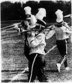
The Nicholas County High School Band has participated in two contests, including this one in Fleming County. The final concert of the year is scheduled for this Saturday.