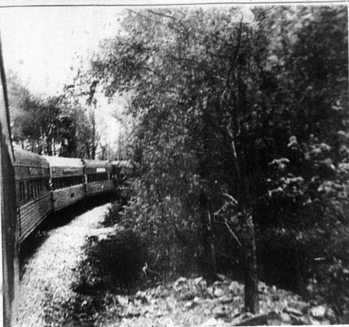
The shades of Autumn line the track as the historic No. 152 speeds along toward Carlisle in Paris. A truck drove before the train to clear the tracks and another truck followed the train in order to put out any fires started by the cinders of burning coal that came from the smokestack.