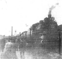
Early morning finds the passengers boarding No. 152 Saturday morning.