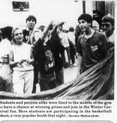
Students and parents alike were lined to the middle of the gym to have a chance at winning prizes and join in the Winter Carnival fun. Here students who participating in the basketball show, a very popular booth that night.