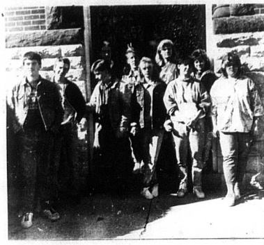
Carlisle Christian Church Youth Group prepared to take a trip to Louisville to the Christian Youth Convention last weekend. Other churches from Carlisle, namely Blue Lick Christian Church, joined in with the all day classes and gospel singing in the evening.