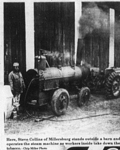
Here, Steve Collins of Millersburg stands outside a barn and operates the steam engine as workers inside take down the tobacco.

FAIR STOCKMARKET WEDNESDAY, NOVEMBER 11, 1987 RICE - 48¢ (Unchanged in last week's market and 1/2¢ lower. 48¢/bu. - 48¢/bu. under 43 lbs. 2/28¢/bu. over 43 lbs. 48¢/bu.) NEW YORK AND CHICAGO CATTLE AND CALVES BLAUGHTER COWS - $1.00 - $4.00 BLAUGHTER HEIFERS - $1.00 - $4.00 BLAUGHTER STEERS - $1.00 - $4.00 STOCK MARKET DOW JONES INDEX: 2,931.41 (Up 14.35) CATTLE RECEIPTS NOVEMBER 11, 1987 CATTLE (All weights) - 11,000 head CATTLE (All weights) - 11,000 head CATTLE (All weights) - 11,000 head FAIR STOCKMARKET THURSDAY, NOVEMBER 12, 1987 RICE - 48¢ (Unchanged in last week's market and 1/2¢ lower. 48¢/bu. - 48¢/bu. under 43 lbs. 2/28¢/bu. over 43 lbs. 48¢/bu.) NEW YORK AND CHICAGO CATTLE AND CALVES BLAUGHTER COWS - $1.00 - $4.00 BLAUGHTER HEIFERS - $1.00 - $4.00 BLAUGHTER STEERS - $1.00 - $4.00 STOCK MARKET DOW JONES INDEX: 2,931.41 (Up 14.35) CATTLE RECEIPTS NOVEMBER 12, 1987 CATTLE (All weights) - 11,000 head CATTLE (All weights) - 11,000 head CATTLE (All weights) - 11,000 head