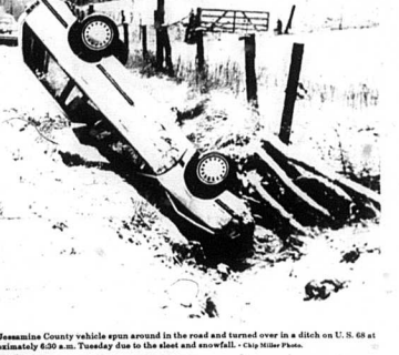
This Jessamine County vehicle spun around on the road and turned over in a ditch on U.S. 68 at approximately 6:20 a.m. Tuesday...

CCC was wonderful then but it would not work today... "CCC was wonderful then but it would not work today..."