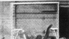
FOR PERMITS... DUNKIN' BOOTH... The students enjoyed the dunkin' booth at the banquet.

Presentations of scholarships were also presented at Thursday night's activities.