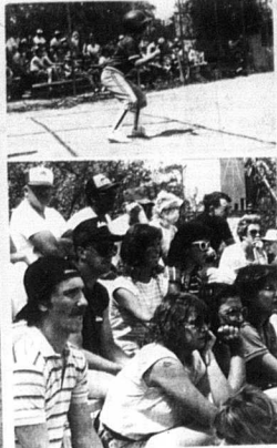
Top left, a Nicholas County Little League is squaring to bust, while another, top right, heads for the plate. Bottom center, players of coaches of all teams marched from Clark's Food and Fun Center, through Carlisle, to east and park to show their stuff before a large crowd. Bottom left, parents and fans watch the first day's action.