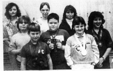
These students first, second or third place in the various categories in the Nicholas County Public School Science Fair...