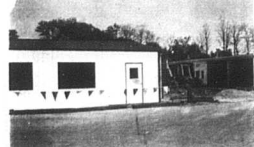
Under construction (above) is the new addition to Clark's Food and Fun Center on West Main Street where the game room is scheduled to be located.