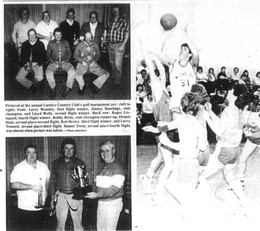
Carlinville players struggle for rebounds during the game. Scott County's Scott County boys' basketball team defeated Carlinville 45-37 in a game played at Carlinville on Monday night.