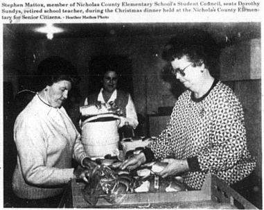
Members of the Fish and Game Club preparing old ham sandwiches during the club's Christmas dinner. Some local officials were there to join in the Christmas fun.