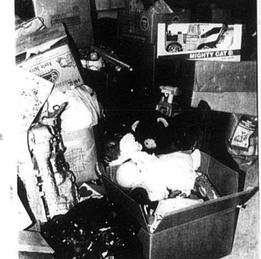
Toys collected through the Mountain of Love community project are piled high in the Nicholas County Volunteer firehouse. The toys are to be distributed by the Nicholas County Volunteer firemen to the underprivileged for Christmas.