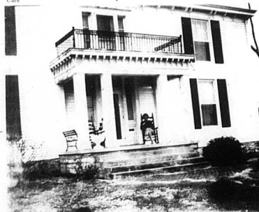
The King house displays the Greek Revival architecture. It was built around 1865 by Corwin Robinson.