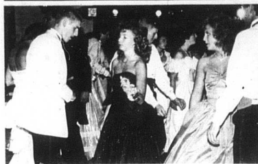
"This Night Will Last Forever" was the theme for the junior-senior prom held Saturday, April 24, at the high school in Carlisle. These students are enjoying a fast dance to the music provided by "Sounds Unlimited."