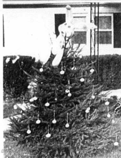
This Easter tree was spotted on U.S. 68 west of Carlisle.