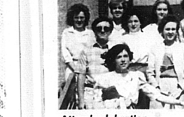
Attendance celebration. The Nicholas County Elementary School students were in Louisville on May 5 to take part in the Kentucky Immigration Celebration at the Kentucky Center for the Arts...