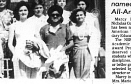
Hospital notes. The Nicholas County Hospital staff met on Wednesday, May 21, at 8:30 a.m. in the Nicholas County Hospital Conference room.

The A. J. Winters Co. Paris Jewelers Since 1885. 419 Main, 418 Main, 417 Main, 416 Main, 415 Main, 414 Main, 413 Main, 412 Main, 411 Main, 410 Main, 409 Main, 408 Main, 407 Main, 406 Main, 405 Main, 404 Main, 403 Main, 402 Main, 401 Main.