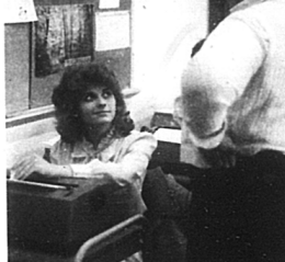
Typing skills needed