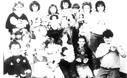
(Stuffed) animals at school