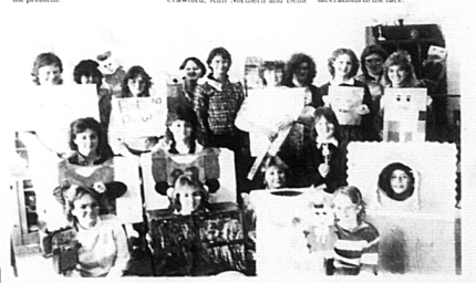
Using puppets to teach