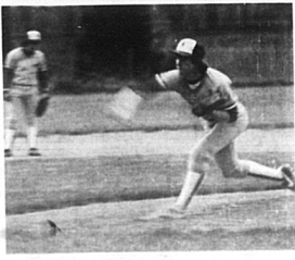
Nicholas wins CKC opener