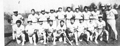
The 1986 Nicholas County High School baseball team.

4 — The Carlisle (Ky.) Mercury, Thursday, April 10, 1986