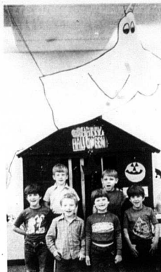
Kindergarten spook house