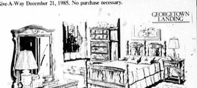
This suite consists of chest-on-chest, triple dresser and mirror, full or queen size upstate bed (not bed not shown).

Reg. $1574.00. Now during our Pre-Holiday Sale $1195.00