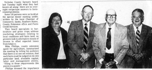
Nicholas County farmers heard last Tuesday night what they had known all along: There are no overnight success stories to farm-related problems. Some 115 persons were on hand at the special dinner meeting, underwritten by the local Chamber of Commerce, banks, Southern States, County Extension office and Farm Credit Services.

They heard specialists in horticulture and grain crops address marketing strategies relating to local conditions and farm land, as growers look for alternative means of income to offset expected losses from labor.