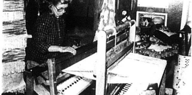
A Mann-made rag rug