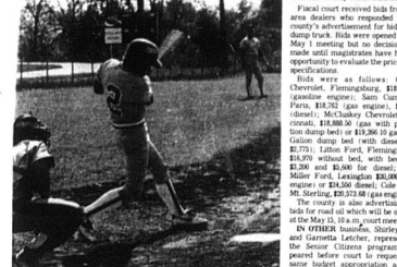
Contributing to a record

her supplier for the Mann's Homestead Antique Shop died last year. See Home Account, page 2.