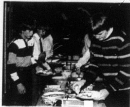
Taking their turn at the table