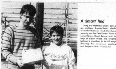
A 'Smart' find