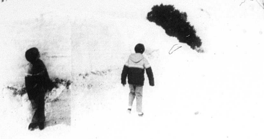
Towering over him