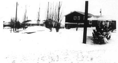
This was a typical scene Friday afternoon of the snow lining the road often reached 10 to 15 feet. The piles of