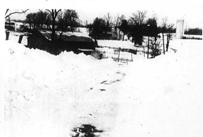
East Union Road was barely visible to Mercury Friday. Staff members in their heavy winter gear of the county