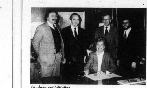
Little League All Star teams reach quarter-final action