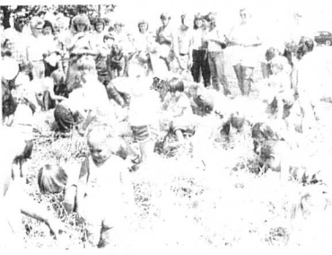
Pennies in a strawstack