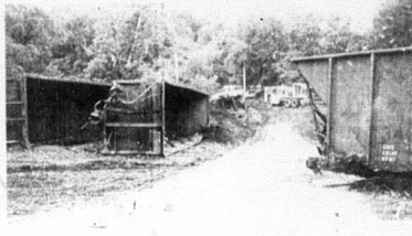
Scene of derailment

Overhauled coal cars mark the start where 14 cars of a TTI freight train derailed in Myers Aug. 19.