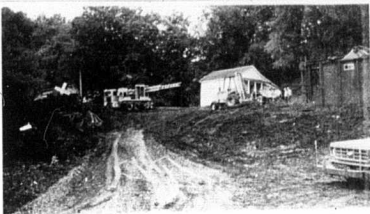
Repair work begins

Overhauled coal cars mark the start where 14 cars of a TTI freight train derailed in Myers Aug. 19.