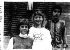
Youth Assembly delegates