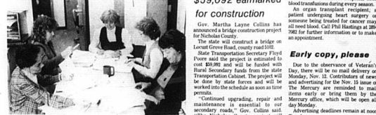
Gov. Martha Layne Collins has announced a bridge construction project for Nicholas County.