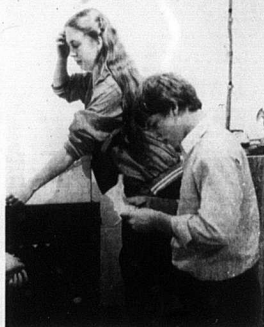
Students prefer Republicans!