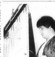
Scholastic award The Jackets entered the final frame with a 1-0 lead... The Jackets entered the final frame with a 1-0 lead...