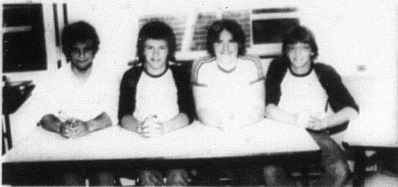
NCHS Welding Team