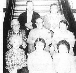
Parks/Recreation Board officers