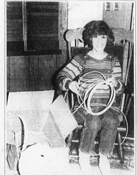
Preserving a heritage